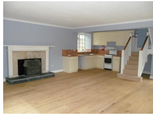
Internal View of Kitchen

The property is available end of March 2017.